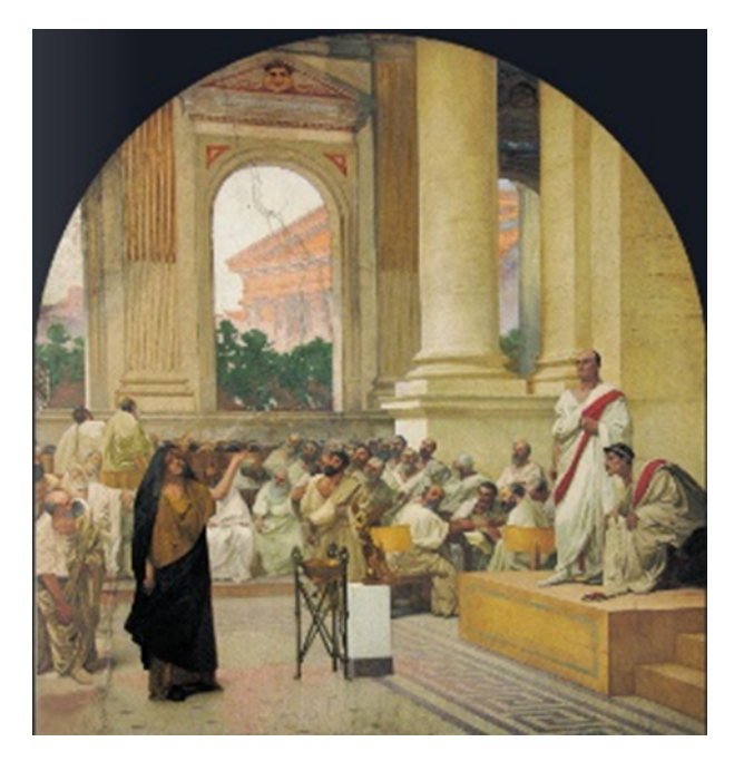
2. C. Maccari, La liberta Ispala Fecenia denuncia l'associazione dei Baccanali.

Rome, 186 BC: The freedwoman Ispala Fecenia denounces Bacchanals.