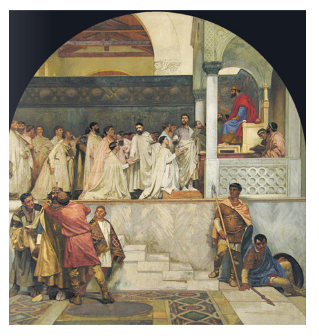
4. C. Maccari, Ottone III consegna ai giudici i libri giustinianei.

only the Emperor can intervene on the text (auctoritas), by means of principles and criteria taken from the edict itself.