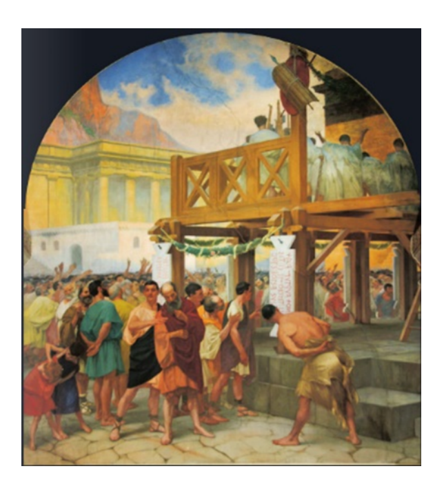
1. C. Maccari, La pubblicazione della legge delle Dodici Tavole. Rome, 451-450 BC: The Law of the Twelve Tables is published.

The legislation of Rome is written down for the first time, inscribed on bronze (or ivory) and, most importantly, it is affixed in the Forum, for everyone to read. It represents an important victory for the plebeians over the patrician pontiffs-jurists who, until that moment, held a monopoly on the interpretation of the law.